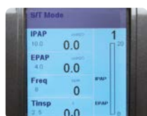
3.5 inch screen