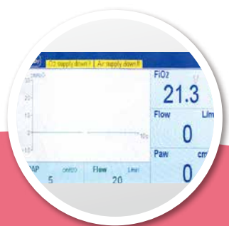
7" TFT LCD screen

The CPAP System makes a good performance in Neonatal Intensive Care Units (NICU) and other departments. Rooe Medical CPAP System offers you the choices you need in ventilation, monitoring and technique. The expertise in ventilation is based on more than 23 years rich history of developing CPAP solutions that meet your requirements. Great performance is based on high security, high accuracy, high stability and accurate monitoring.