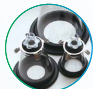
Veterinary Mask (Optional)