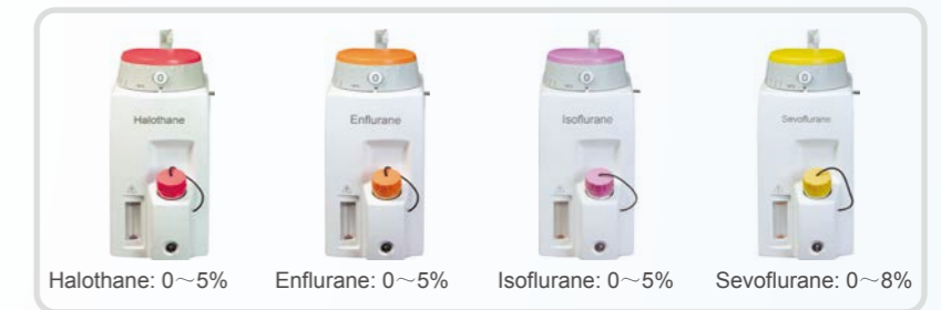
Halothane: 0~5% Enflurane: 0~5% Isoflurane: 0~5% Sevoflurane: 0~8%

1 set vaporizer for standard, can be installed 2 vaporizers in all.