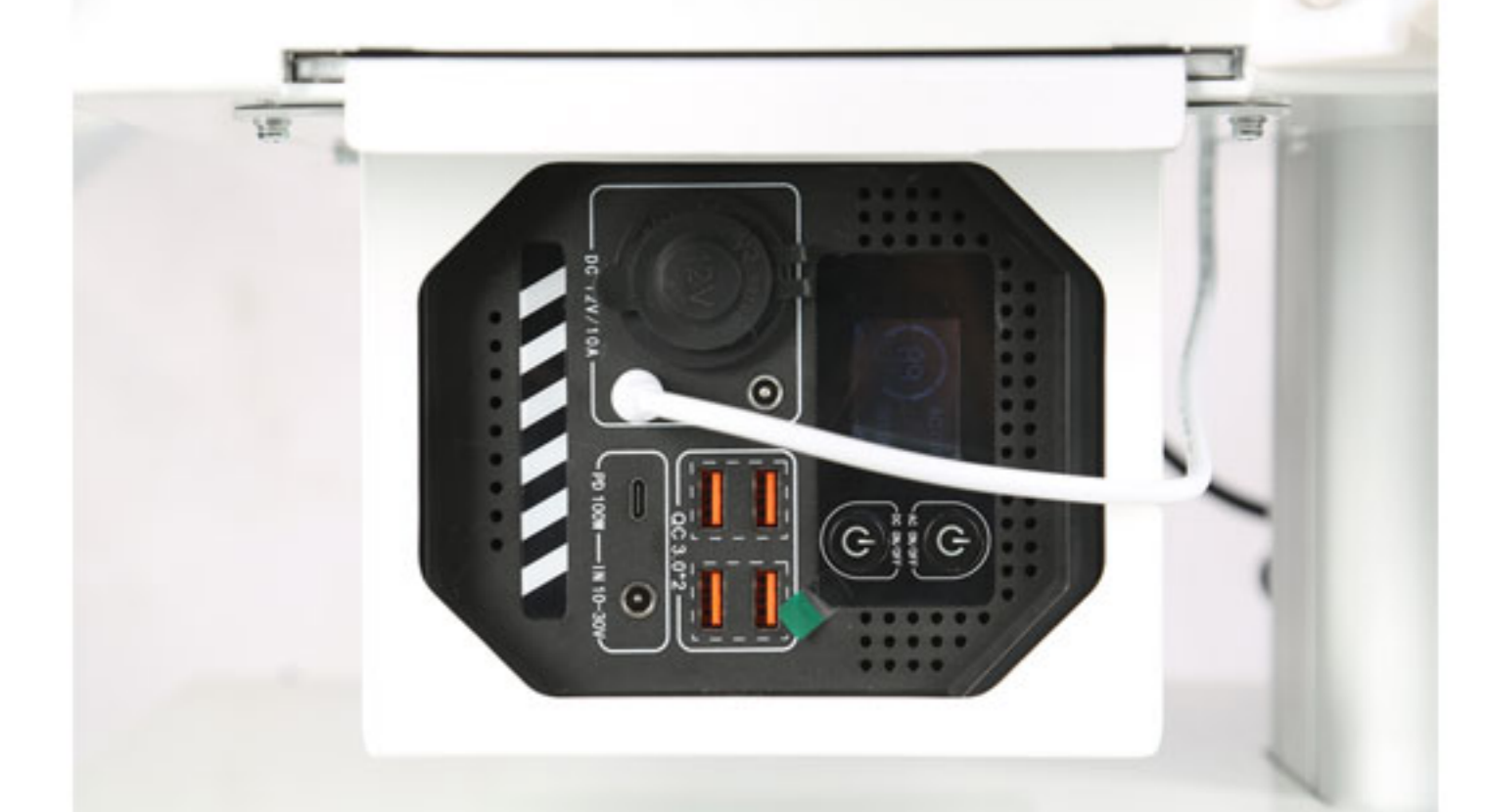
Optional: UPS power system AC output