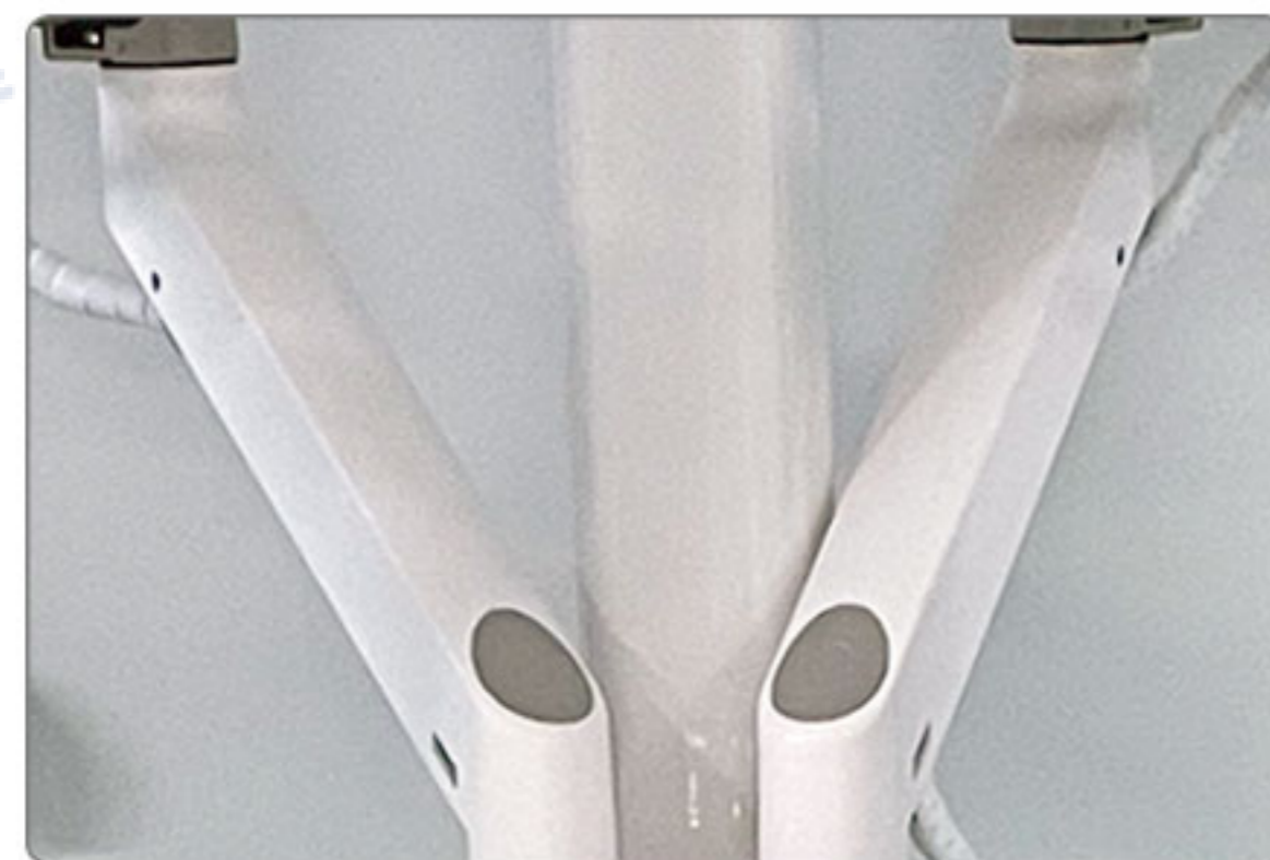
Dual Screen Bracket