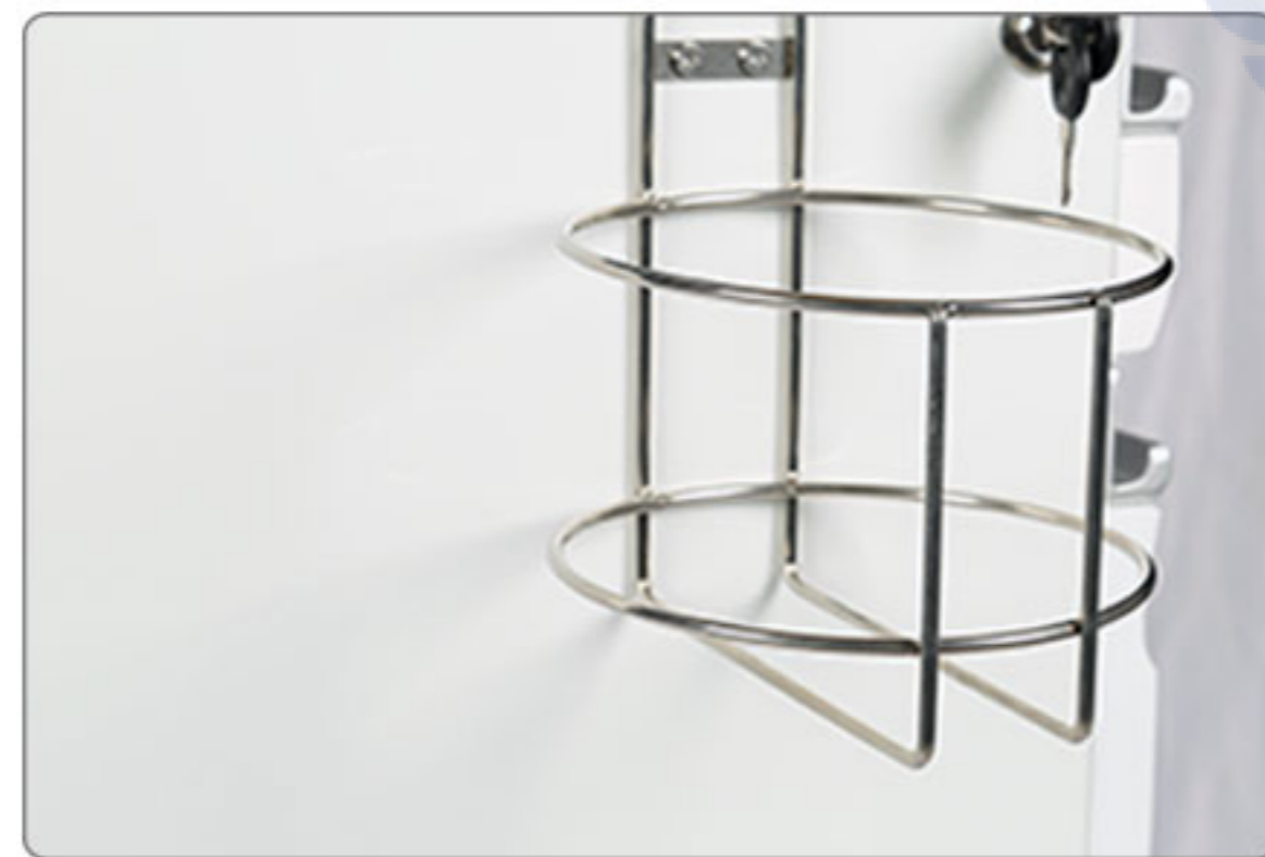
2L Needle Disposal Holder